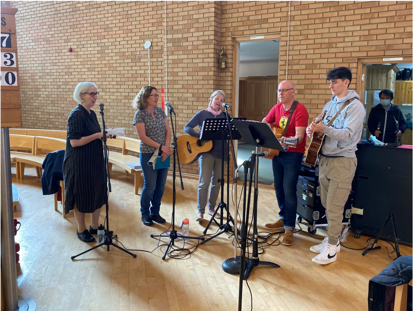
Picture: The St Joseph's Catholic Church, Epsom Folk Choir in full voice