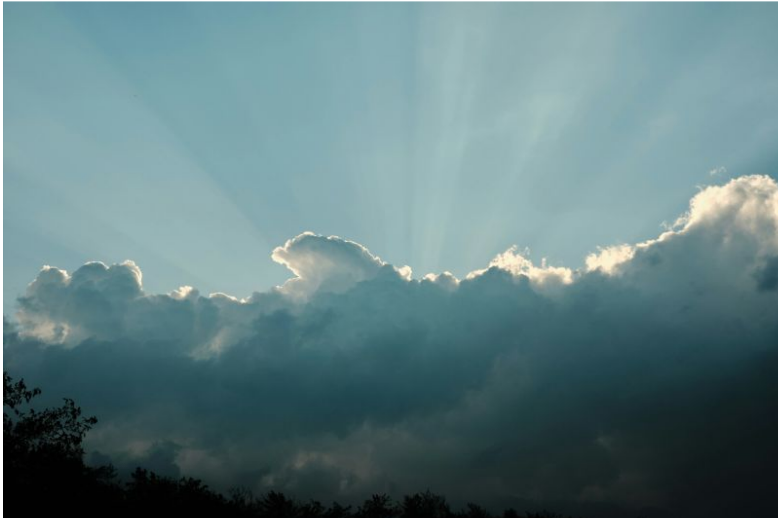
Images: Pink umbrella in the rain, and The sun is shining through the clouds in the sky