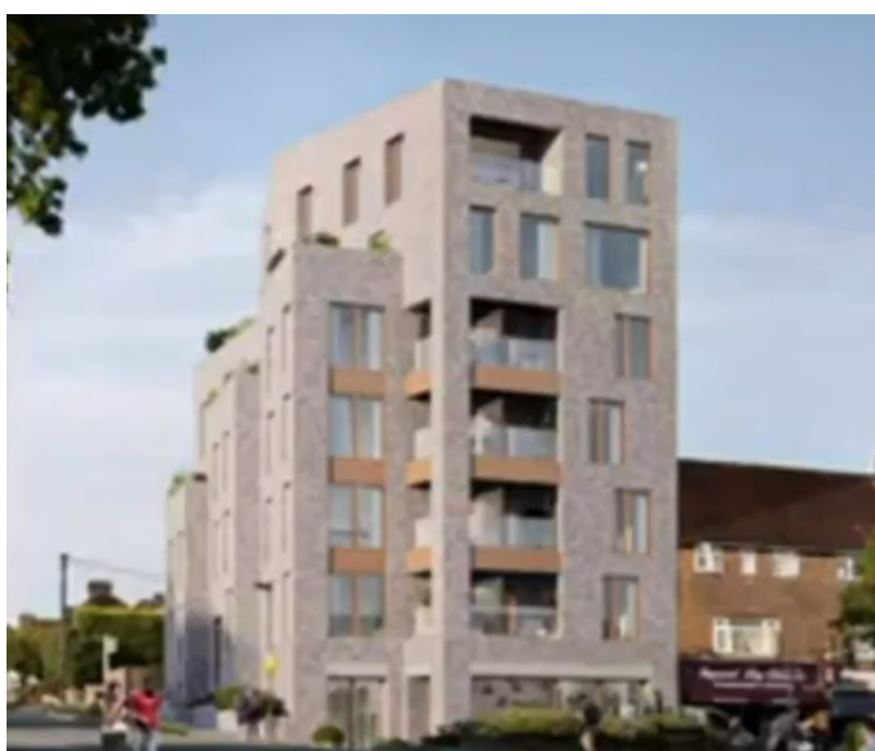
Image of original 6 storey block

Secondly, he travelled to Station Approach Stoneleigh and suggests the rejection of a plan to build a four storey block of flats was mistaken. The plan was rejected in February 2022. The developer Woolbro Homes ( a part of St James Group Ltd which is a wholly owned subsidiary of the multi-million Berkeley Group Holdings Plc ) did not exercise its right of appeal to a Planning Inspector.