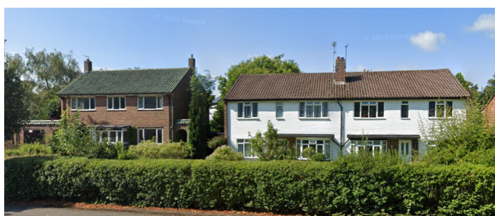
Green Gables next to white rendered houses in Ashley Road