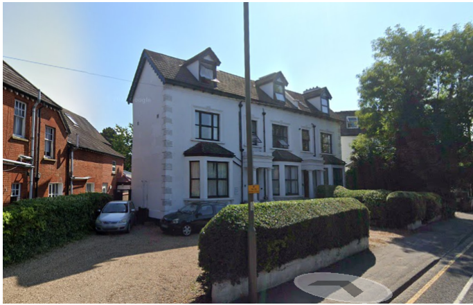
Houses opposite Green Gables