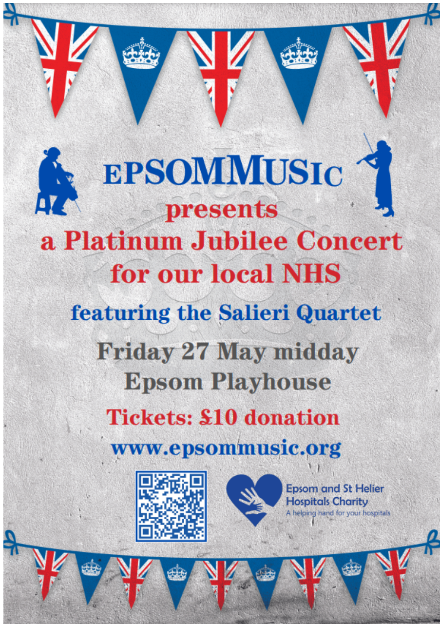
Jubilee Concert poster