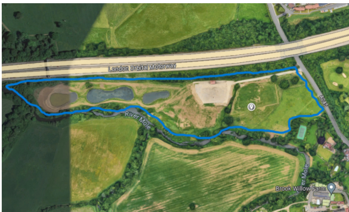
The Wildlife area between River Mole and clockwise carriageway of M25

A planned wildlife centre would restore land bordered by the M25 and the River Mole, and give the charity a future rescuing and rehabilitating animals in Surrey.