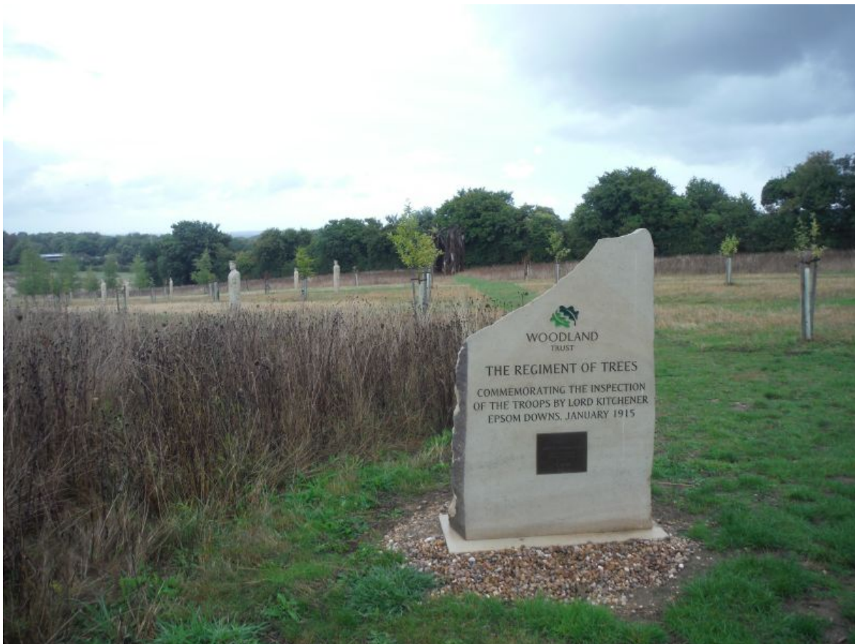
Ed: This story was ready to break just before Queen Elizabeth II died. Out of respect for the Royal Family we put a hold on publication until after the State Funeral. The car park remains closed as of today.