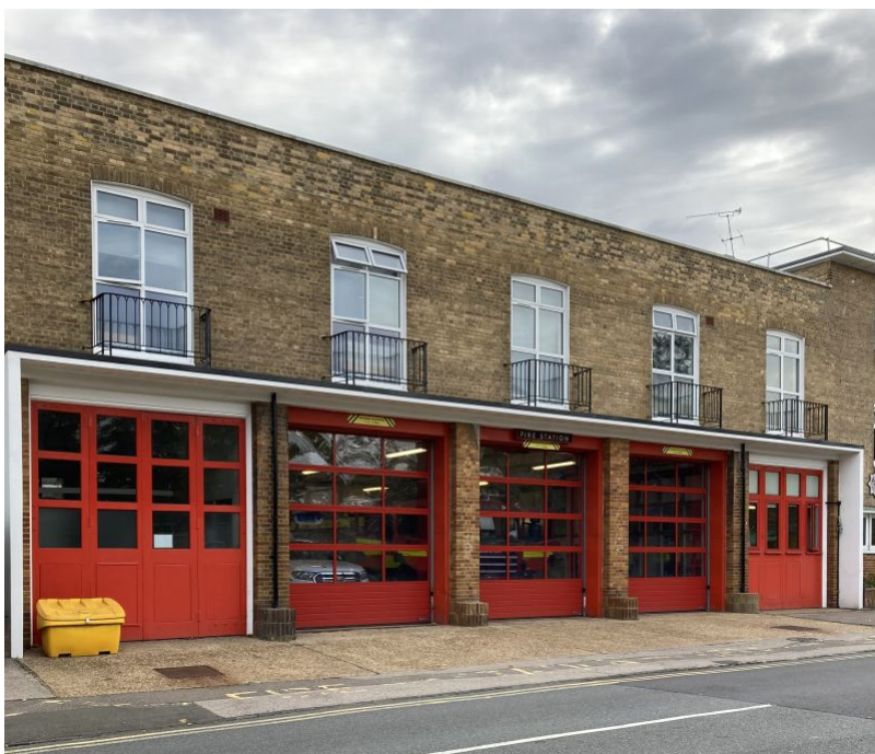
Epsom's Church Street Fire Station

Surrey Fire and Rescue Service Email businesssafety.education@surreycc.gov.uk