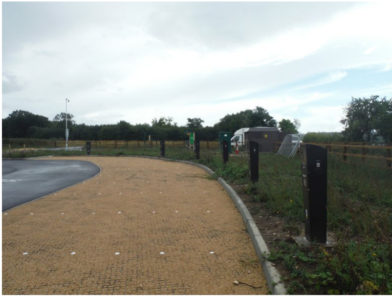
Line of electric vehicle charging points waiting for power.

The 650 acre Centenary Wood at Langley Vale is the English site of the four for the four nations of the United Kingdom. Epsom and Ewell is very privileged to have this extraordinary amenity at our doorstep.