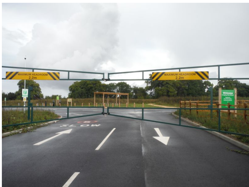
Car Park closed during normal hours at the Centenary Wood

As today’s photos show, they are nearly ready but the car park remains closed. Walking is the best way to get to the Wood at the moment. The narrow country roads that surround the wood have no safe places to park.