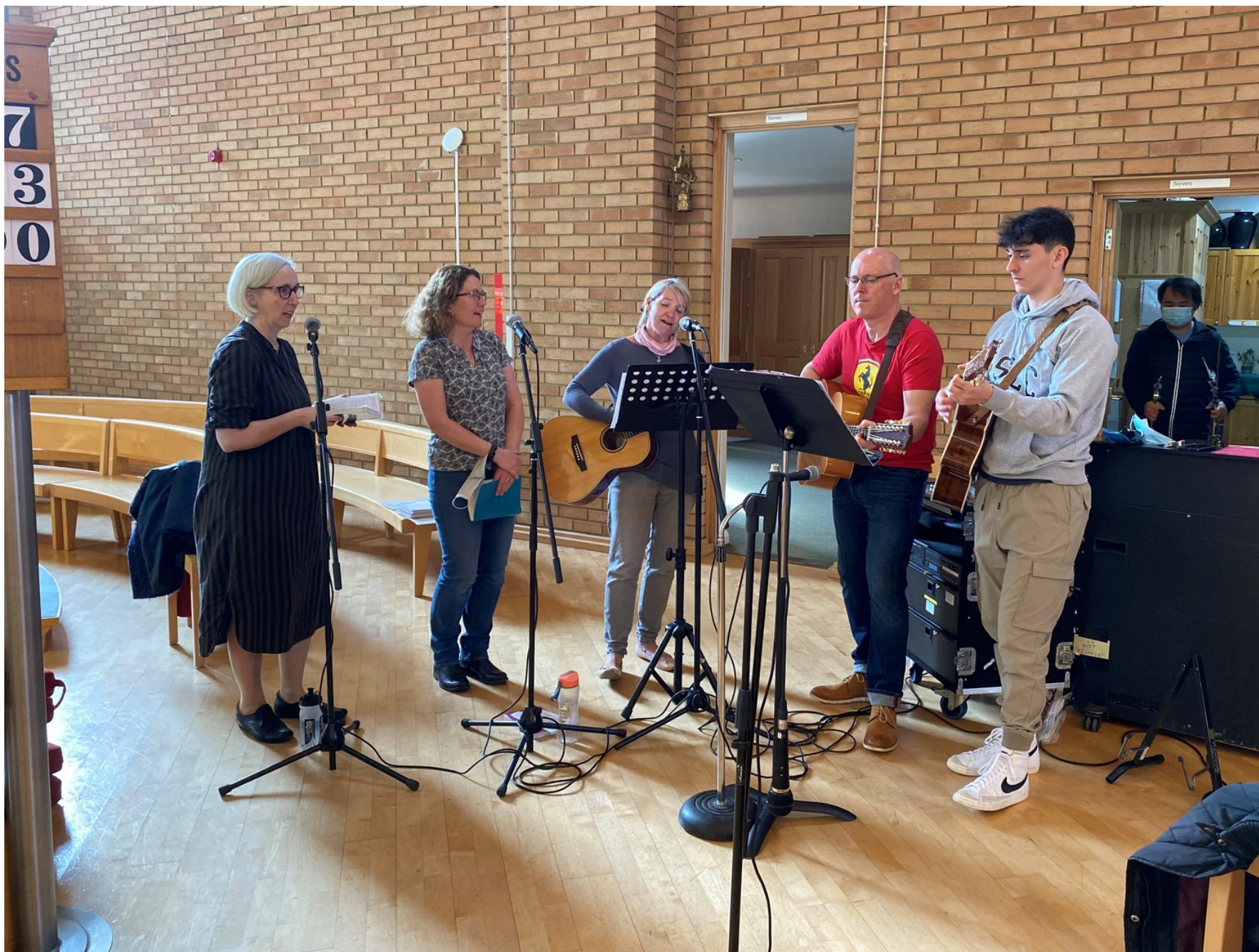
Picture: The St Joseph's Catholic Church, Epsom Folk Choir in full voice