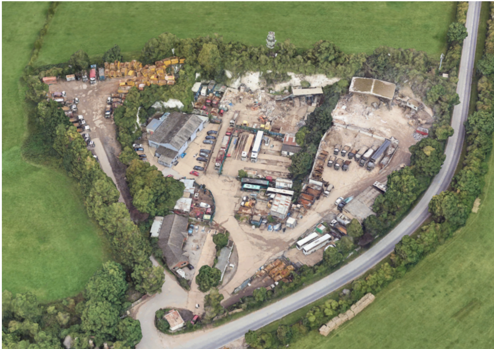
Aerial view of the Chalk Pit site

He continued: “If there was illegal activity, the Environment Agency and the council would have shut the site down, which they’re very good at doing. The same situation with dust - if the dust was so bad, don’t you think that we would have been shut down by now?”