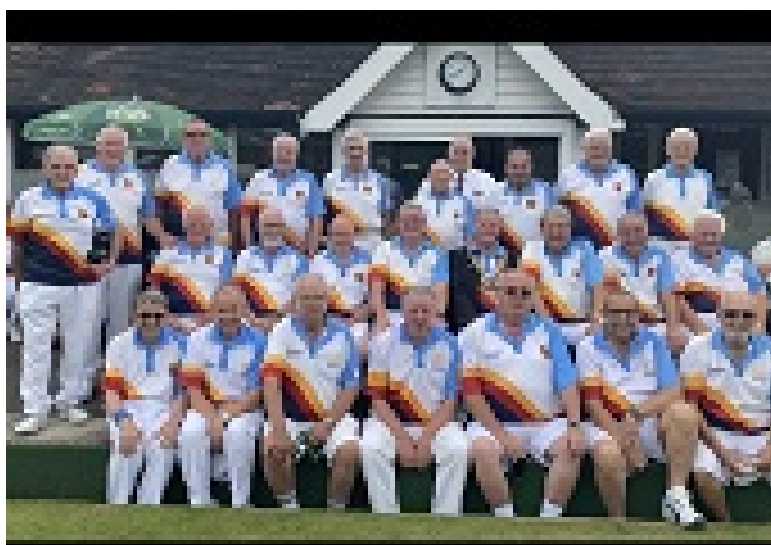
Surrey President's Team v SCMPBA

Epsom first played Old Coulsdon in 1998 and have played 24 times, won 9, lost 15.This season Epsom Ladies have played 4 League matches, won 2 & lost 2.Epsom Ladies have won the League 3 times - 2005/2006 & 2019.