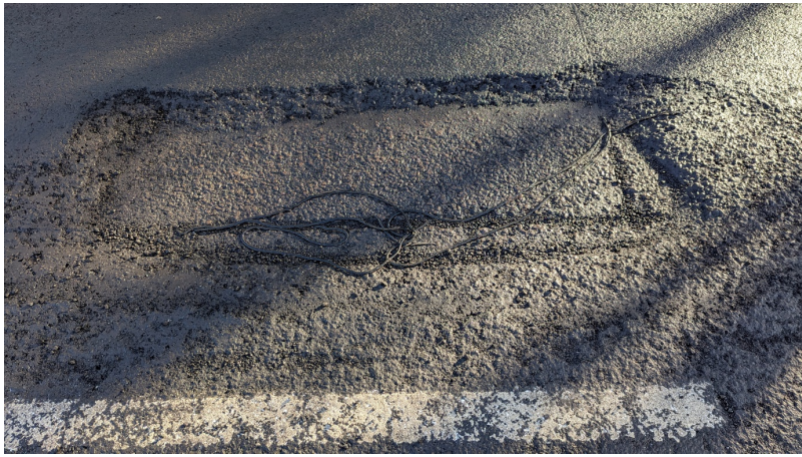
Cable exposed by pothole

Although Surrey County Council sends teams out to repair potholes they consider dangerous, the general surface of the road continues to deteriorate. On a stretch of Woodcote Green Road between Sunnybank and Pine Hill, about 450 metres long, more than 60 defects in the road surface are apparent. Some of these are no more than 2 cm wide and 10 cm long. One varied in width from a few centimetres to about 15cms, was 17 meters long and entirely in a cycle lane. Another was about a square meter in area and had cable exposed arising from and disappearing back into the road surface. Reporting a pothole shallower than 3cms or other road surface issues results in the message: “This issue is likely to be assessed as a low priority when inspected. We will probably wait to repair it as part of future improvement works.”