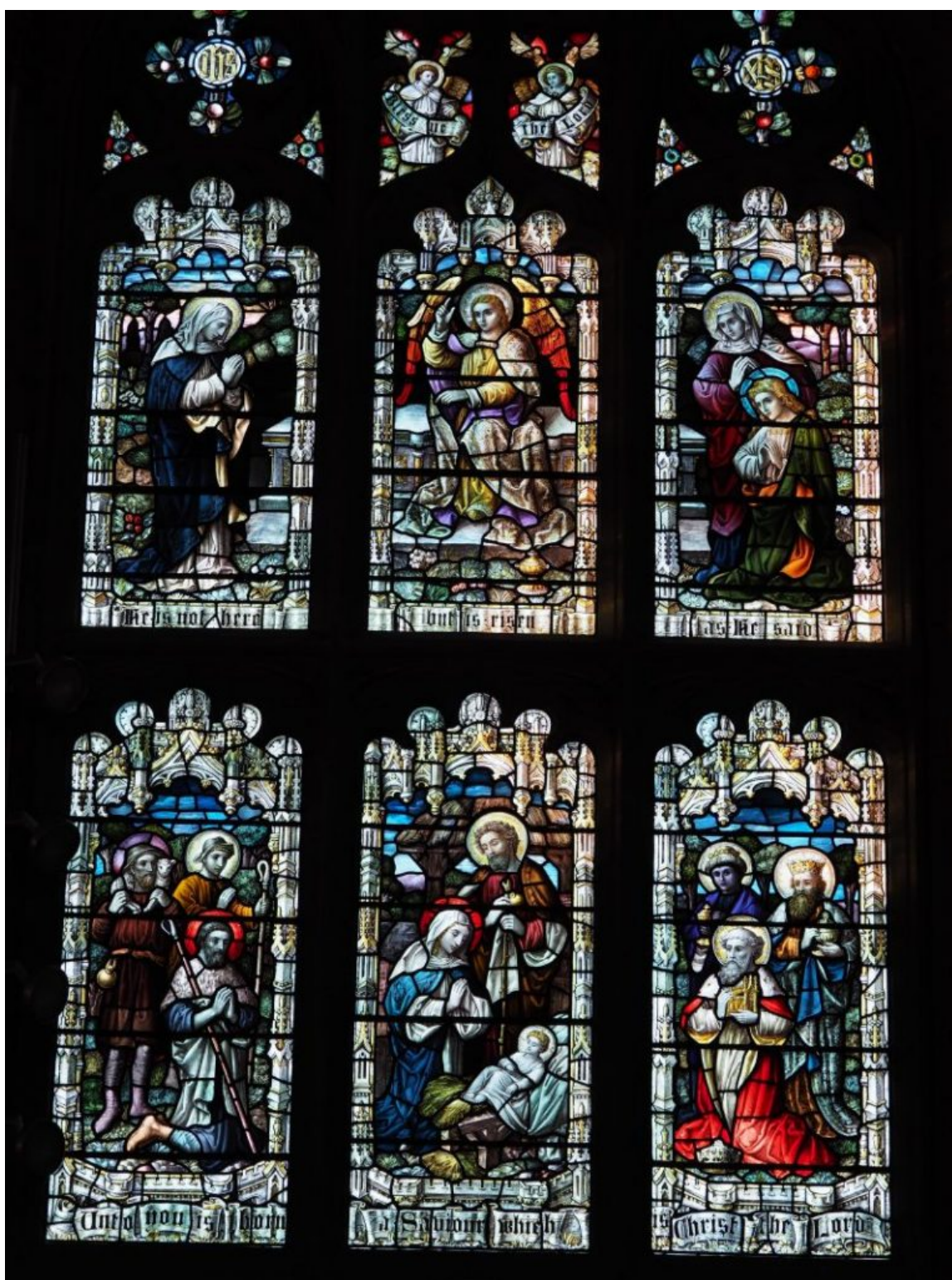
Unveiled by Winston Churchill.