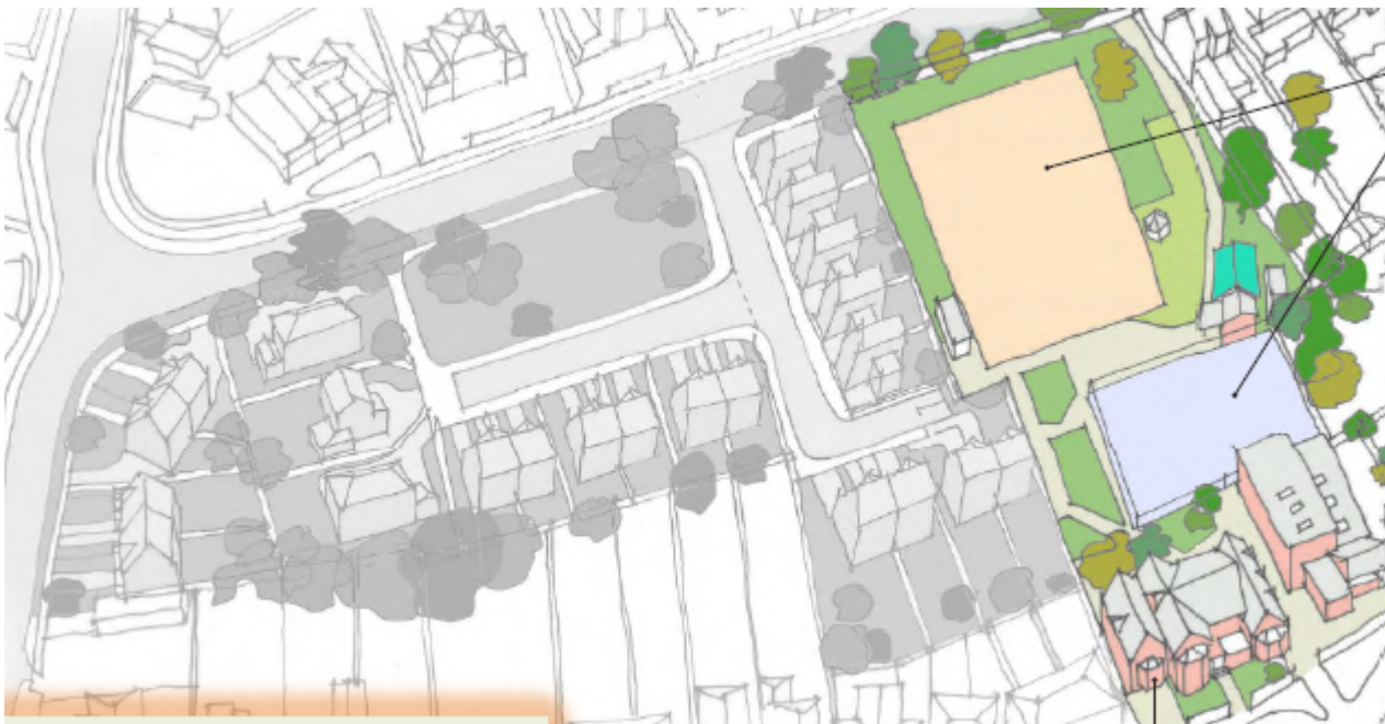
New development in grey and proposed reduced school site in colour.