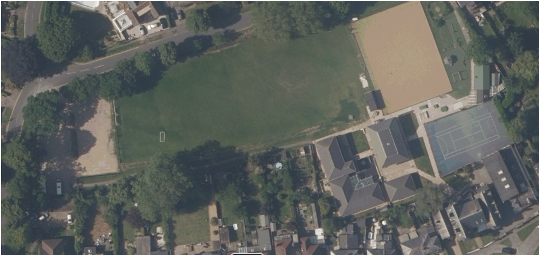
Aerial view of Kingswood House School's site.