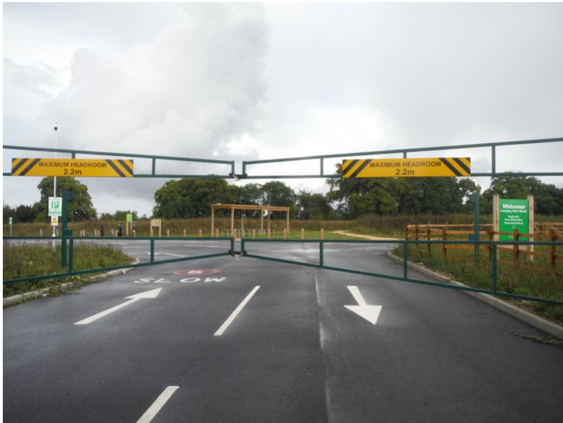
Car Park closed during normal hours at the Centenary Wood