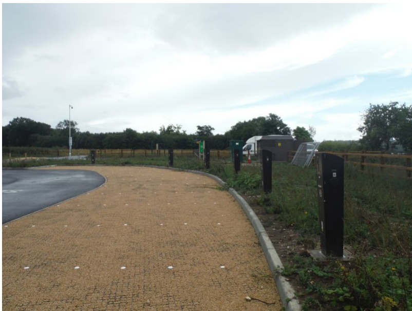
Line of electric vehicle charging points waiting for power.

The 650 acre Centenary Wood at Langley Vale is the English site of the four for the four nations of the United Kingdom. Epsom and Ewell is very privileged to have this extraordinary amenity at our doorstep.